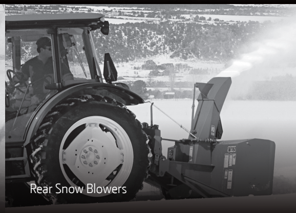
Rear Snow Blowers