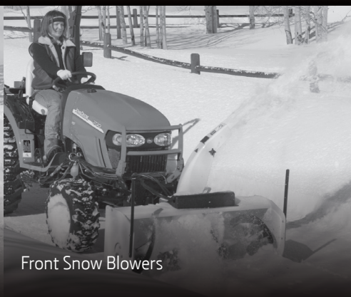
Front Snow Blowers